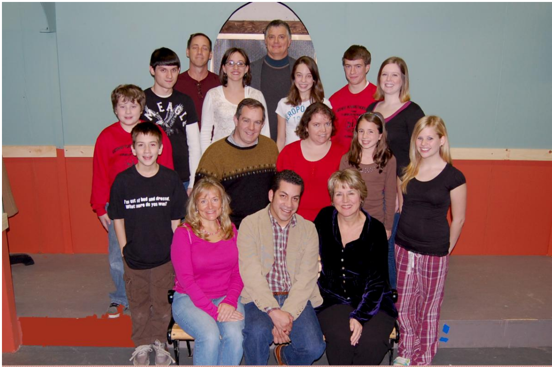
A Candle In The Window - 2009

Past productions: A Candle in the Window-2009, Fiddler on the Roof- 2016, On Golden Pond- 2013. and our home for many years- the Gateway Arts Barn.