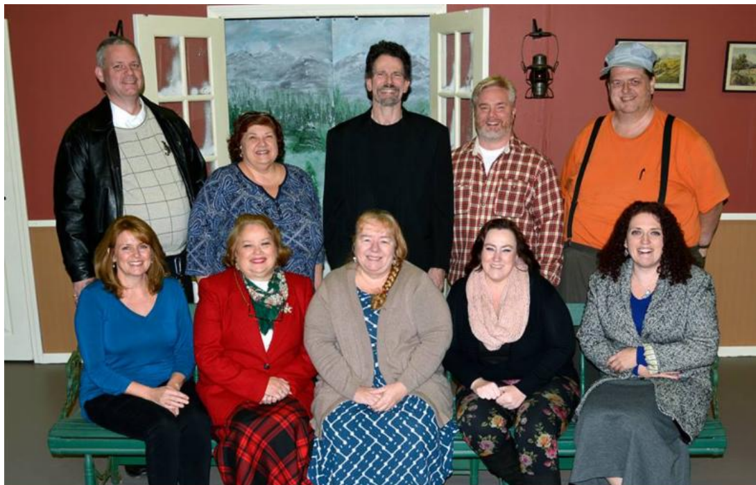
The Christmas Express 2015