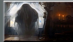
The Spirit of Christmas or The Story of Ernestina Scrooge December 4, 5 & 6

Call For Tickets 508-764-4531 Online at https://gateway-players.ticketleap.com