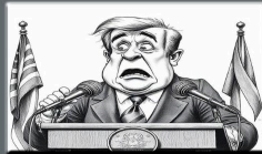
The Outsider October 9, 10, 16, 17 & 18