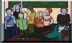
Remedial February 27, 28 March 6, 7 & 8