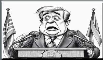
The Outsider October 9, 10, 16, 17 & 18