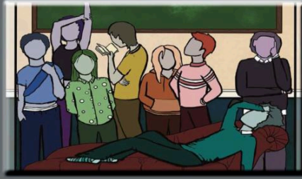
Remedial February 27, 28 March 6, 7 & 8