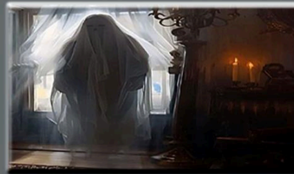
The Spirit of Christmas or The Story of Ernestina Scrooge December 4, 5 & 6

Call For Tickets 508-764-4531 Online at https://gateway-players.ticketleap.com