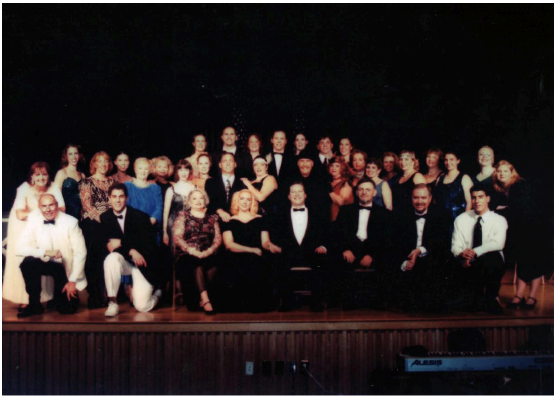
Gateway Players Theatre, Inc. | PO Box 171 | Southbridge, MA 01550 US